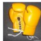
Quality Boxing Gloves